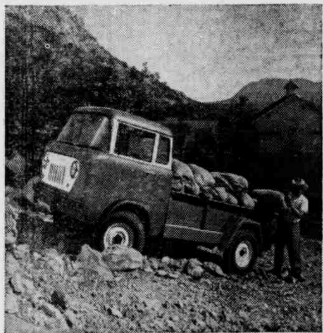
Forward Control 'Jeep' FG-170

The U. S. Government does not pay for this advertising. The Treasury Department thanks, for their patriotic donation, The Advertising Council and