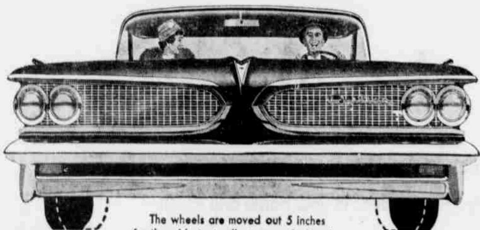
The wheels are moved out 5 inches for the widest, steadiest stance in America.

No "narrow-gauge" car corners as surely as PONTIAC!