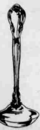
Sterling is for now...

Serving pieces illustrated are in Chantilly design. Gravy Ladle $13.75; Sugar Spoon $7.00; Lemon Fork $4.75. All prices include Federal Tax. Other most-wanted serving pieces in 18 lovely Gorham Patterns to $25.00.