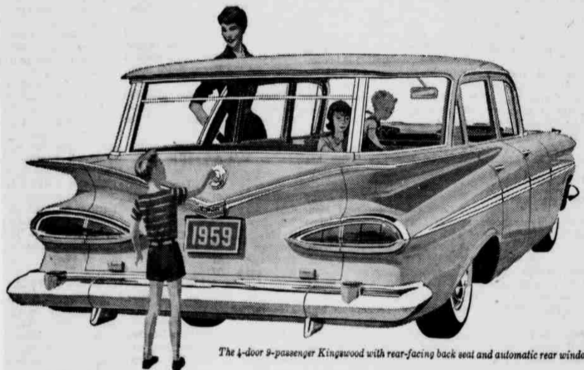
The 4-door 9-passenger Kingswood with rear-facing back seat and automatic rear window