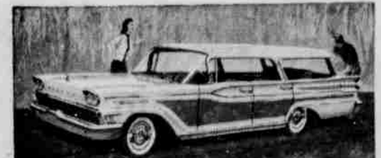
MERCURY'S COUNTRY CRUISERS —Unique hardtop styling. Retractable rear window. Fold-away 3rd seat that faces front. Concealed package compartment.