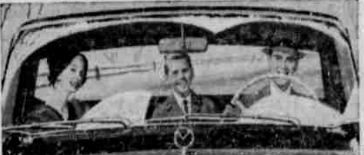
MERCURY'S FIRST WITH SIDE-TO-SIDE WIPERS —They clear a 42% larger area—a 5-foot swath—including the center section. Only Mercury has this aid to safer driving.