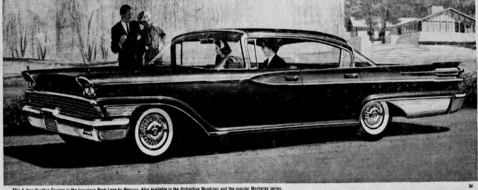
This 4-door Hardtop Cruiser is the luxurious Park Lane by Mercury. Also available in the distinctive Montclair and the popular Monterey series.

These folks have their eyes on a bargain—a whole list of bargains, in fact. They're looking over the out-of-town telephone rates on the inside cover of their phone book. It's interesting to see how many places you can call—for so little money. Why don't you check the sample rates in your directory. And surprise an out-of-town friend or relative with a call tonight. Pacific Telephone