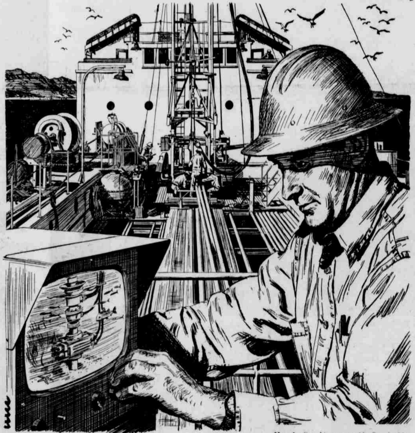
Navy landing ship converted by Standard for off-shore oil search. A 55-foot drilling mast is poised over circular 10-foot-wide opening from deck through bottom.

C-105 Heidelberg Brewery Co., Tacoma, Wash.