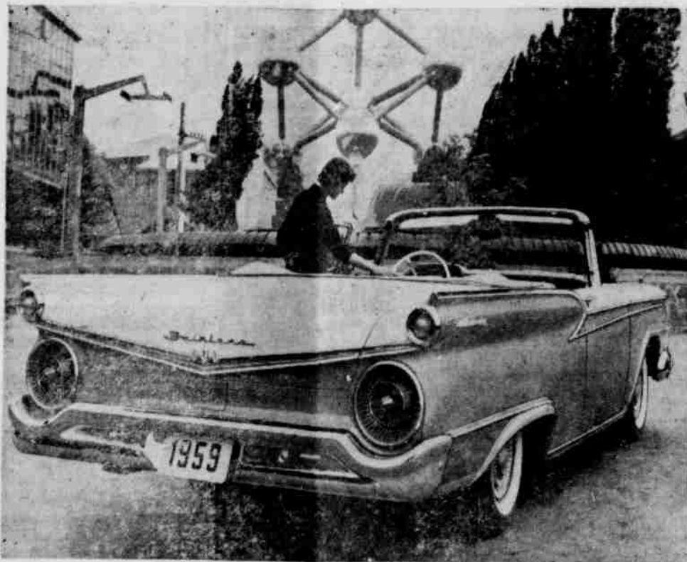
Shown in a picturesque Brussels World's Fair setting is a 1959 Ford Sunliner convertible. Ford offers two convertibles in 1959: the soft-top Sunliner and the retractable hardtop Skyliner. Ford's tasteful styling theme in 1959 is a result of consumer demand for more elegance and dignity, as opposed to gaudiness or extremism. In the background is the Atomium, prominent landmark at the Brussels World's Fair.