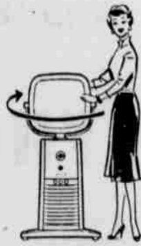
Swivel Screen Pedestal Console PHILCO 4854