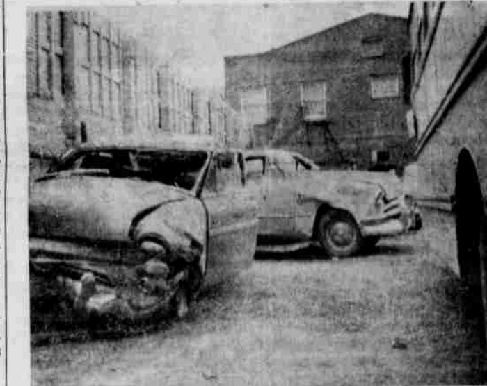
SATURDAY NIGHT ACCIDENT TOLL included these two cars in which six young people were riding. In the foreground is the car driven by Ellis Ball of Ione who, along with three passengers, suffered hurts when it left the road below Lexington and overturned. In the background is the car in which Larry Angell and Ronnie Gray were riding when it overturned on a gravelled road near Heppner.