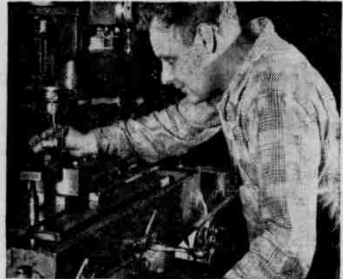
IN THE FACTORY