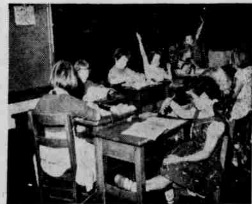
IN THE SCHOOL