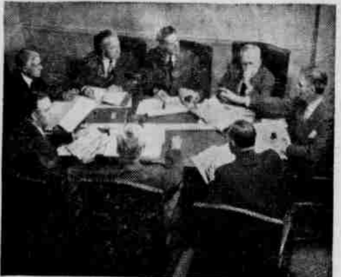
AND AT THE CONFERENCE TABLE

You don't need anyone to tell you our country needs to strengthen its Peace Power. You're reminded of it every time you open your newspaper. And just looking at the children brings it home to you all the more.