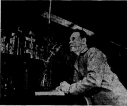
IN THE LABORATORY