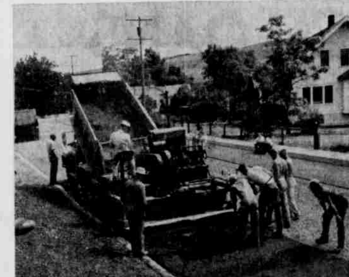
COURT STREET PAVEMENT goes down in a hurry early this week when trucks started hauling hot asphalt mix from Hermiston plant for the Russell Olson Construction company, contractors for the Heppner street improvement project. The curbing and pavement job will probably be completed by Wednesday giving the city another three blocks of modern street. Here the paving machine is laying one of the strips of asphaltic concrete.