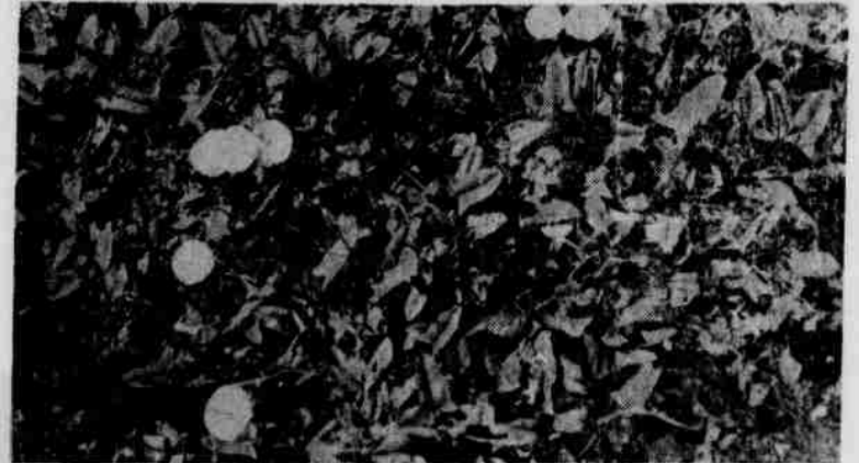
Infestations of bindweed (creeping jenny) like this can take over if left uncontrolled. Millions of dollars are lost each year from noxious weeds, which can now be controlled with new Du Pont Tryben 200, trademark.