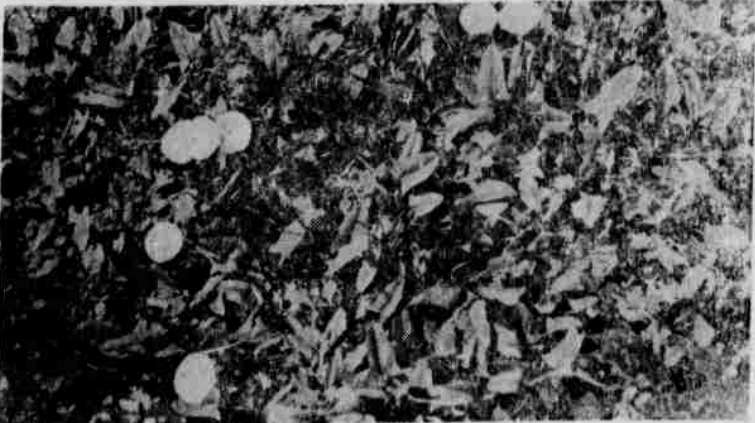
Infestations of bindweed (creeping jenny) like this can take over if left uncontrolled. Millions of dollars are lost each year from noxious weeds, which can now be controlled with new Du Pont Tryben® 200. trademark