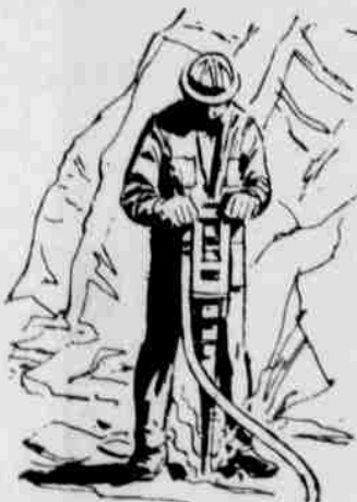
$18 million in paychecks this year

PP&L's record construction program means more power for Pacific Powerland. It also means $18-million in construction jobs and paychecks this year.