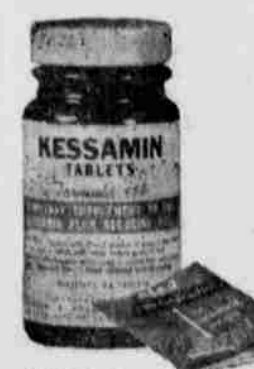
With the Kessamin reducing plan the only thing you can lose is weight!

See your druggist. The complete Kessamin Reducing Plan is in every package of Kessamin Tablets, Formula #14! *THE KESSAMIN REDUCING PLAN IS GUARANTEED TO TAKE OFF A POUND A DAY FOR 14 DAYS OR YOUR MONEY BACK! TRY IT!