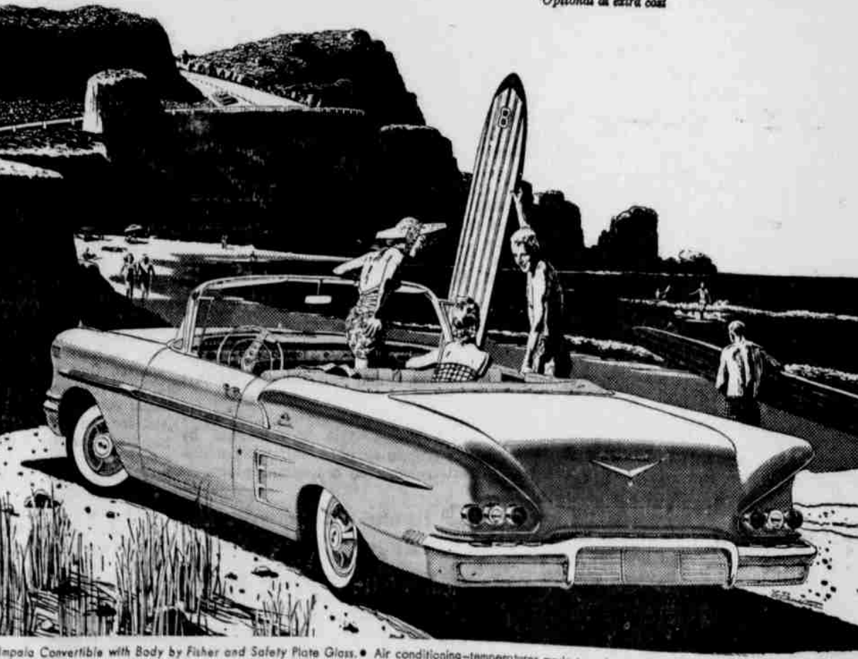
The Impala Convertible with Body by Fisher and Safety Plate Glass. • Air conditioning-temperatures made to order—for all-weather comfort. Get a demonstration!

The only all-new car CHEVROLET in the low-price field.