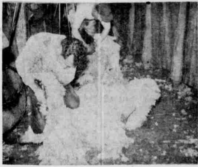
OFF COME THE WINTER WOOLIES—Shearing got under way in earnest last week at the Wilkinson sheep camp on Six Mile canyon near Boardman where nearly 5000 sheep will soon be shorn of their year's growth. Here two of the crew of eight shearers are "undressing" ewes at the rate of one every two to three minutes, or about 800 a day.