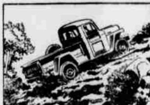
Extra traction: Its 4-wheel drive takes the 'Jeep' Truck up 60% grades—through mud, snow, sand. It shifts into 2-wheel drive for highway travel.