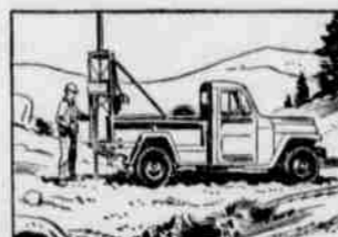
Mobile drill: Mounted on the 'Jeep' Truck, is operated from the truck engine, through power take-off.