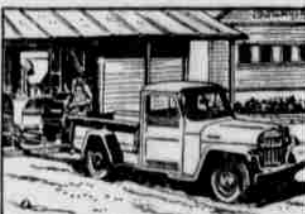
Belt power: With power take-off, it serves as a power unit for operating many types of belt-driven equipment.