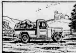
Hauling: The rugged 'Jeep' Truck carries a one-ton payload... 63% of its curb weight! 6,000 lbs. G.V.W., 118 inch wheelbase.