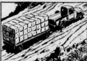
Towing: With the extra traction of its 4-wheel drive, it tows heavily loaded trailers, on the road or off the road.