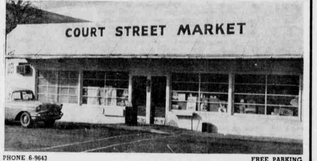
COURT STREET MARKET PHONE 6-9643 FREE PARKING