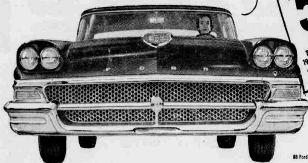
88 Ford Custom 300 Tudor Sedan