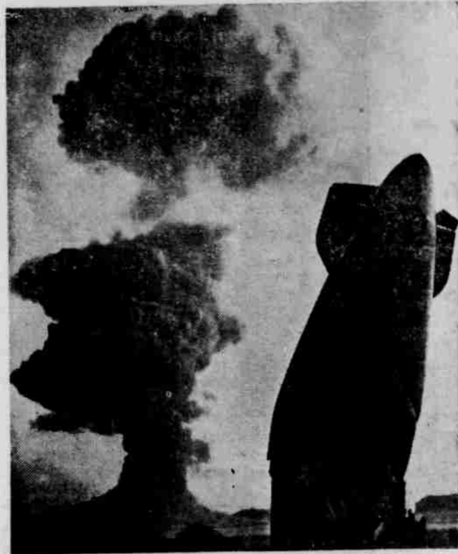
UPENDED AFTER SECTION was all that remained intact of an unmanned U. S. Navy airship which was cruising more than five miles away when a recent atomic test device was exploded in Nevada. The remains of the forward section are on ground at left. Among the experiments conducted during the current Nevada atomic series, called Operation Plumbbob, are tests of nuclear effects on shelters, doors, vaults and buildings which could serve civilians in time of attack.