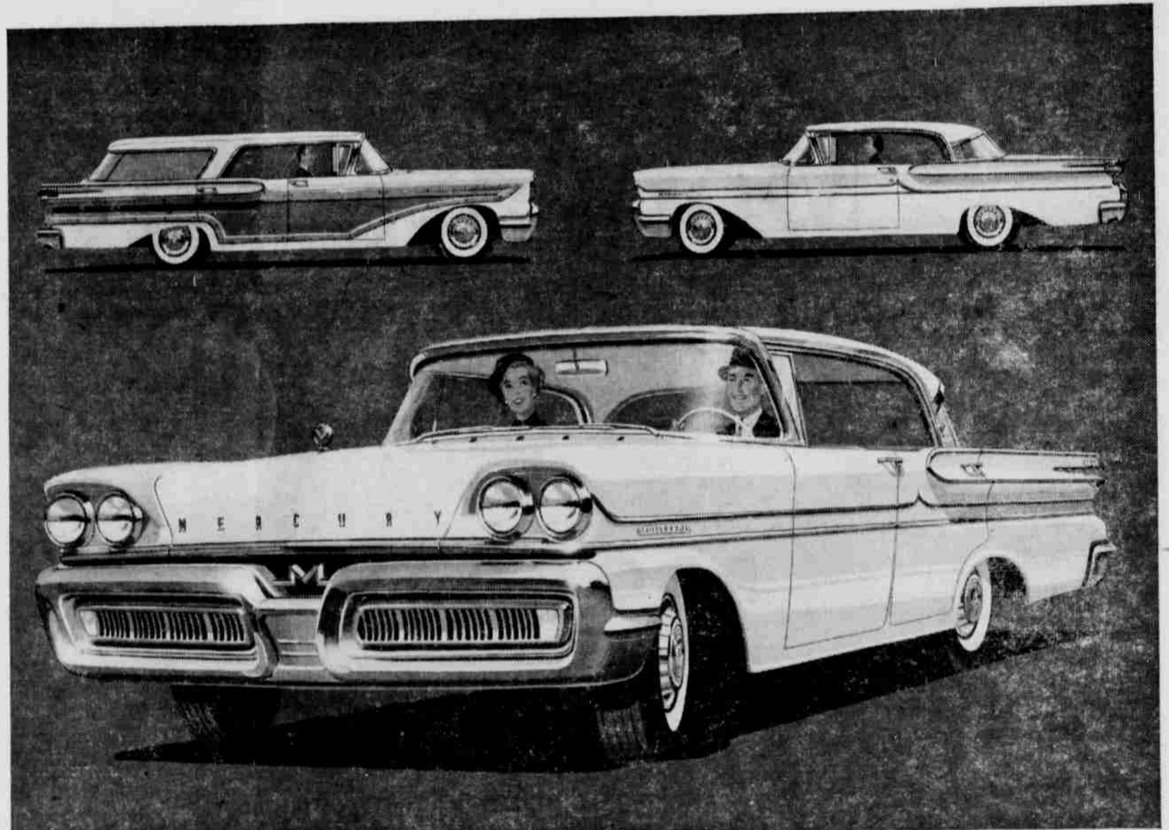
SHOWN (above) ARE COLONY PARK STATION WAGON, MONTEREY PHAETON COUPE, (center) THE MONTCLAIR PHAETON SEDAN.

Only car to bring you Sports-Car Spirit ... with Limousine Ride