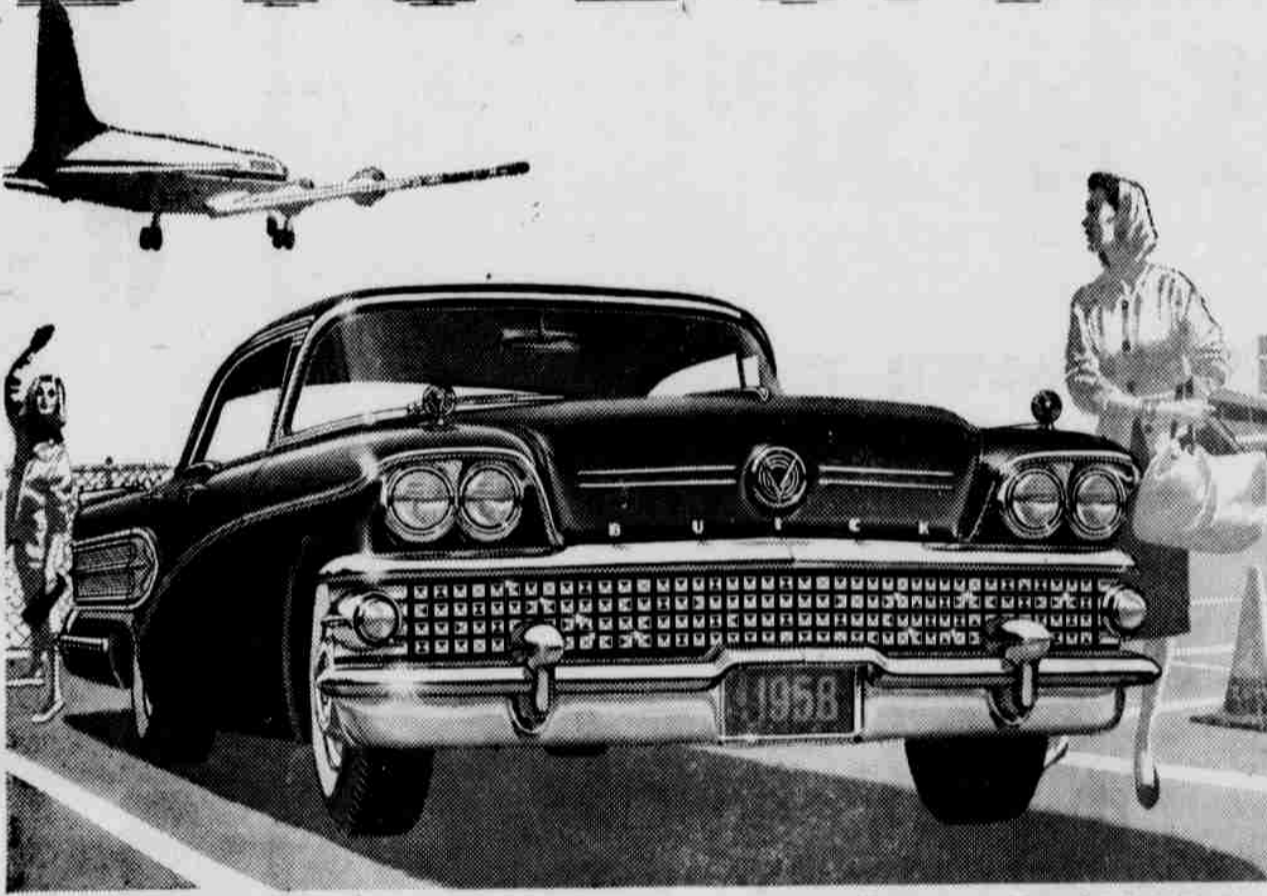
When better automobiles are built Buick will build them

Born of more Aircraft Principles than any other car yet built