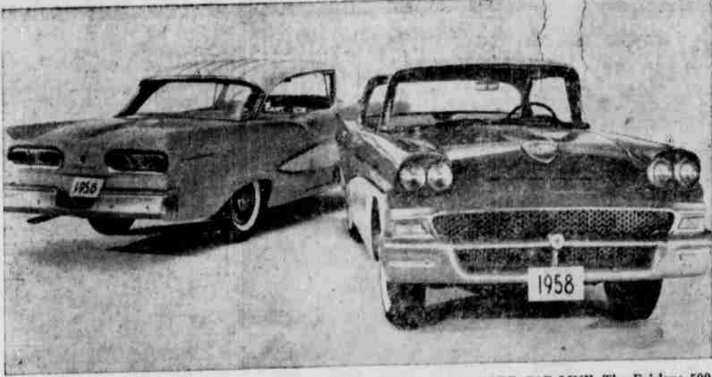
SWEEPING STYLING CHANGES ARE APPARENT IN THE 1958 FORD CAR LINE. The Fairlane 500 Town Victoria (right) and Fairlane Club Victoria (left) share with all new Fords such dramatic styling changes as new safety dual headlights, corrosion-proof anodized aluminum grille, power flow hood, slip stream roof, sculptured inverted V trunk lid and twin safety taillights. Engineering and design advances include new engines, new Cruise-O-Matic transmission and optional Ford-Aire suspension. The new Ford car line will be on display at Ford dealerships on November 7.