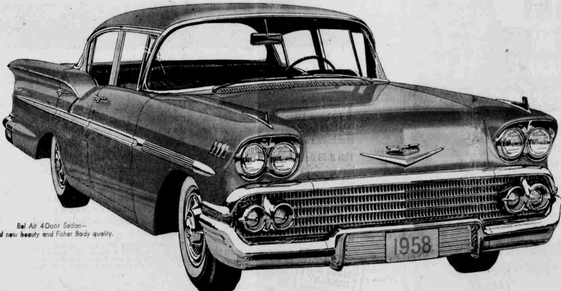
Bel Air 4-Door Sedan—bold new beauty and Fisher Body quality.