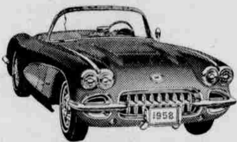
New '58 Chevrolet Corvette—America's only sports car goes even sportier!

The biggest, boldest move any car ever made!