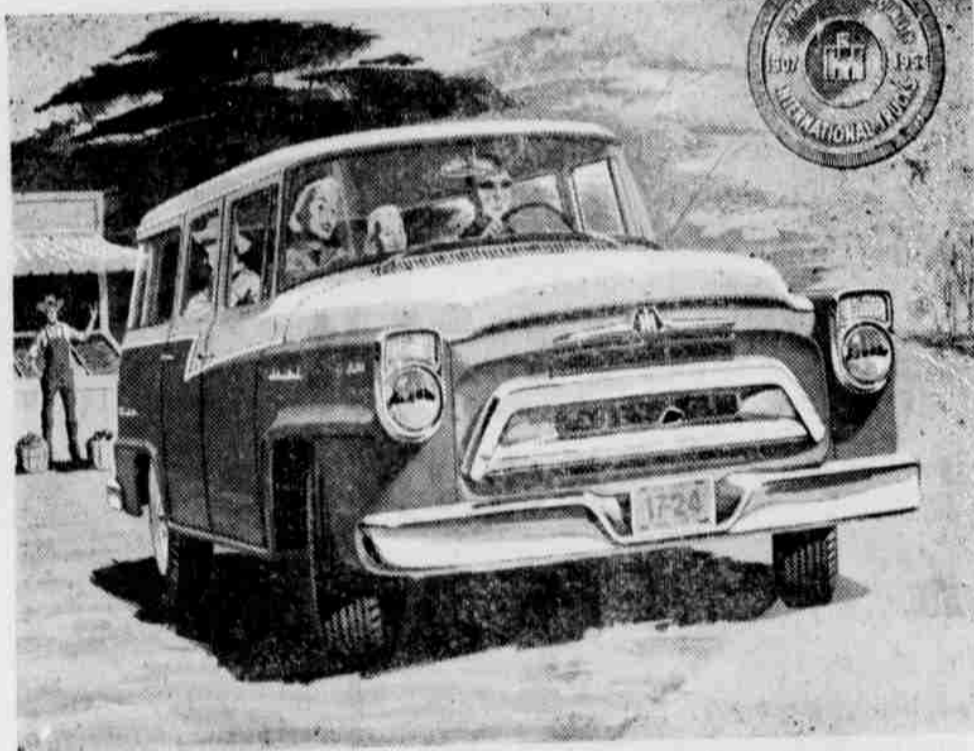
TRAVELALL—one of the Golden Anniversary line of INTERNATIONALs from 1/2-ton pickups through 33,000 lbs. GVW six-wheelers. Other INTERNATIONALs to 96,000 lbs. GVW, round out world's most complete line.

Come in and "ACTION TEST" a new Golden Anniversary INTERNATIONAL