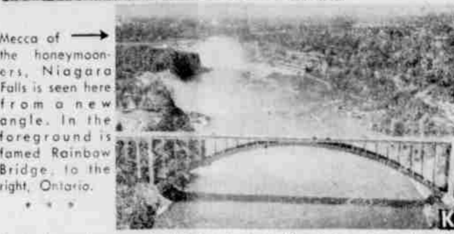
Mecca of the honeymooners, Niagara Falls is seen here from a new angle. In the foreground is famed Rainbow Bridge, to the right, Ontario.

Seven times the size of all New England, Ontario's vastness includes something for every tourist taste. From Toronto's refreshing parks to Ottawa's stately government buildings, nature and history have joined forces to produce a fascinating vacationland. This year, some 17,000,000 tourists, many armed with cameras, will invade our northern neighbor to take advantage of the magnificent scenery.