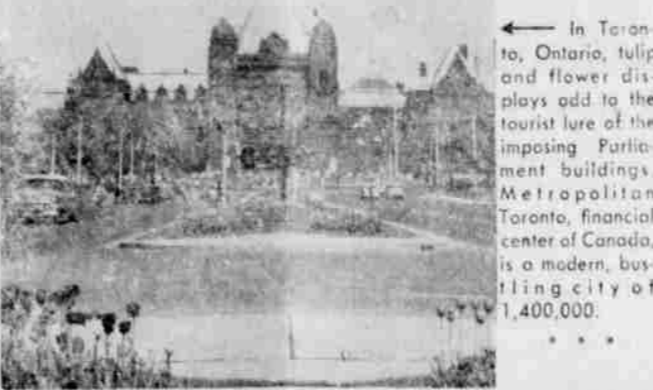
← In Toronto, Ontario, tulip and flower displays add to the tourist lure of the imposing Parliament buildings. Metropolitan Toronto, financial center of Canada, is a modern, bustling city of 1,400,000.