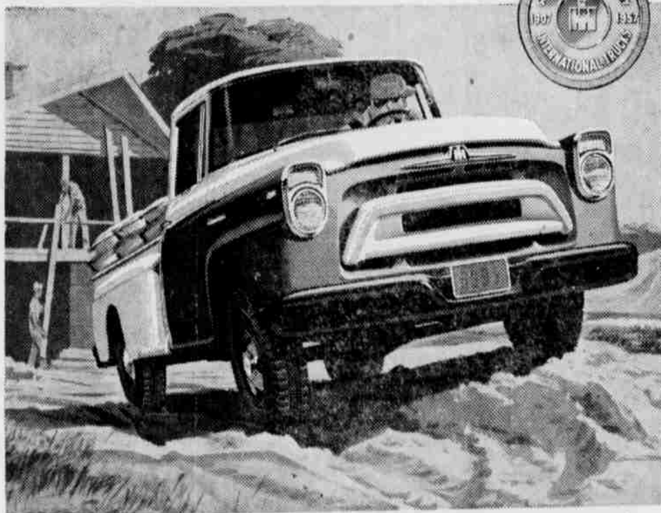
New Golden Anniversary INTERNATIONALS range from Pickups to 33,000 lbs. GVW six-wheelers. Other INTERNATIONALS, to 96,000 lbs. GVW, round out world's most complete line.

Come In and "PERFORMANCE TEST" a new Golden Anniversary INTERNATIONAL