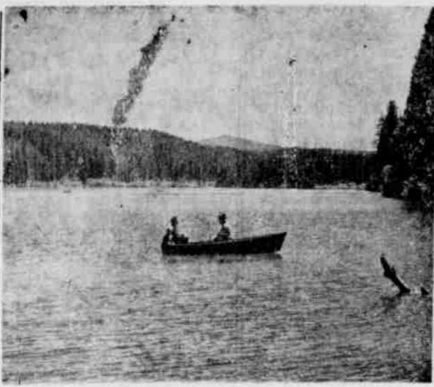
Lava flows dammed the Upper McKenzie creating Clear Lake. In its depths, an ancient, drowned forest can be seen.

We stayed at Laughing Waters in a two-bedroom cabin, done in natural wood and sporting a huge stone fireplace in the living room. A furnished kitchen had clean, ample facilities for meals, which could be topped off with rainbow, cutthroat and Dolly Varden trout, caught easily by