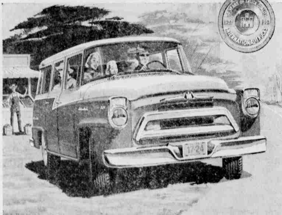
TRAVELALL—one of the Golden Anniversary line of INTERNATIONALS from 1/2-ton pickups through 33,000 lbs. GVW six-wheelers. Other INTERNATIONALS to 96,000 lbs. GVW, round out world's most complete line.

The new TRAVELALL with "Action-Styling" is longer, lower and wider . . . a perfect blending of beauty and utility.