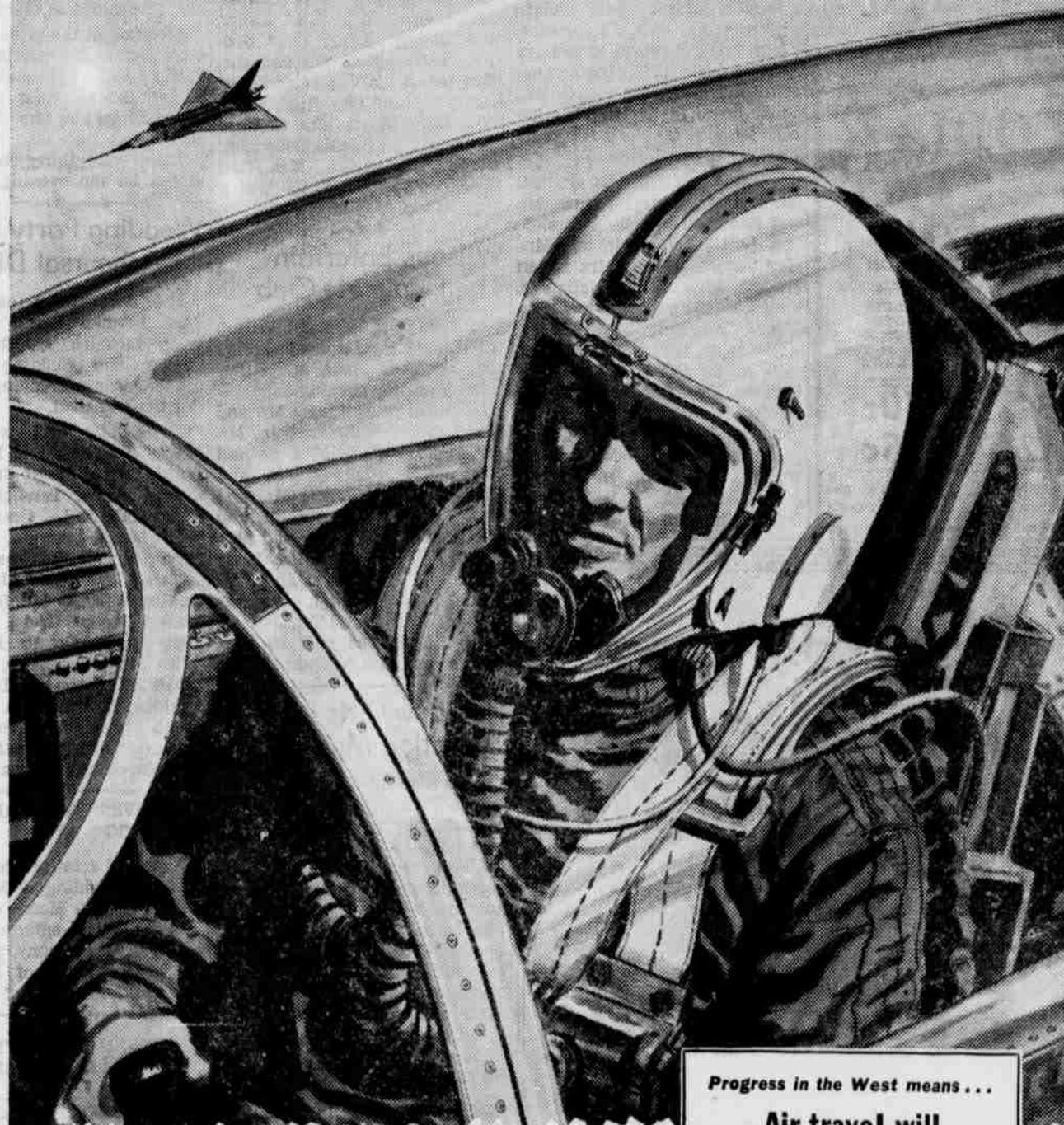
Standard's new synthetic oils help conquer withering jet heat and stratospheric cold.

TEN MILES UP WHERE THE JETS FLY there's a world few men know. Temperatures from 70 to 100 below zero make ordinary lubricants thick and sluggish on controls that must respond instantly. But within jet engines, moving parts must be protected against withering heat up to 600° Fahrenheit.