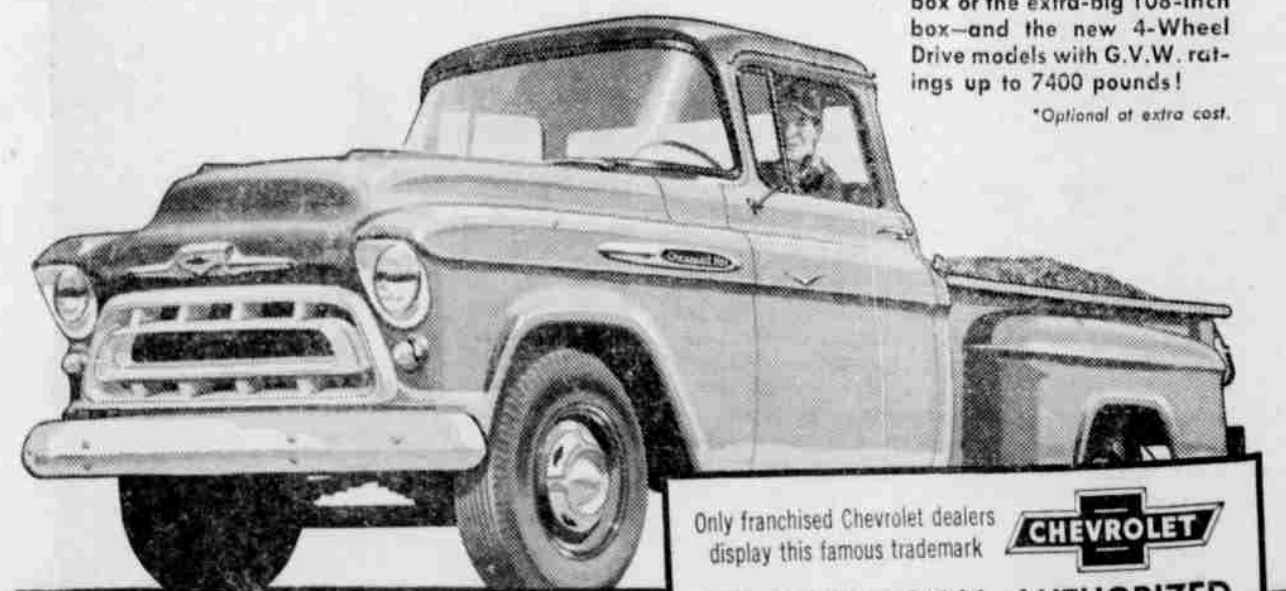
Here's the most popular pickup in America!

Only franchised Chevrolet dealers display this famous trademark