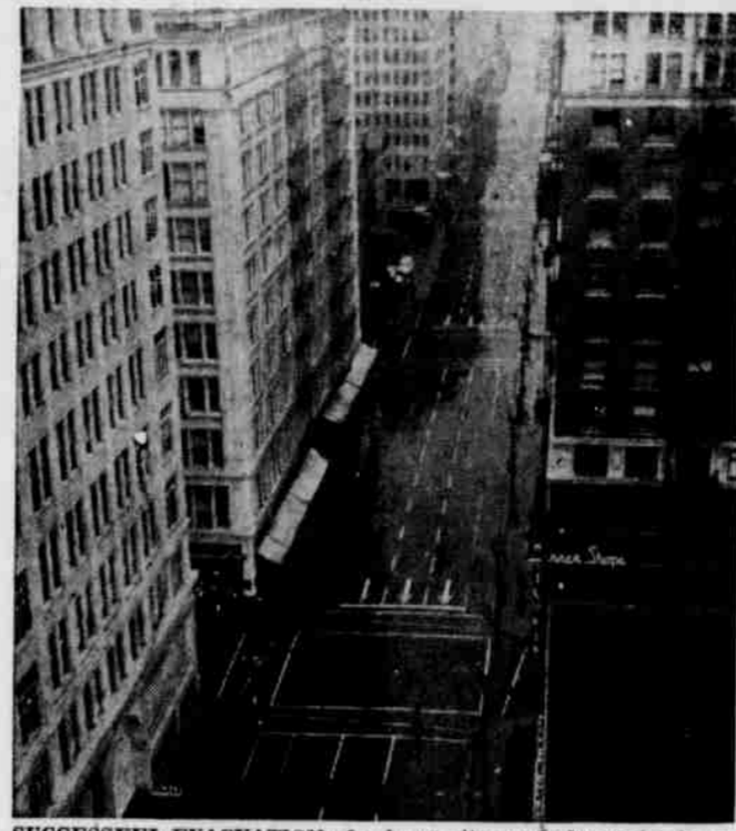
SUCCESSFUL EVACUATION of a large city would leave the downtown area a ghost town, as in this view of Portland, Ore., taken during Operation Greenlight—the largest civil defense evacuation exercise to date. The vast Interstate Highway System under construction would not only facilitate evacuation of large cities, but also would provide roads needed to supply the huge evacuee camps in outlying areas.