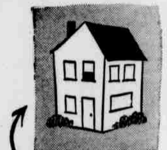
This is a House...

tified blended or rectified wines. This bill deletes this provision.