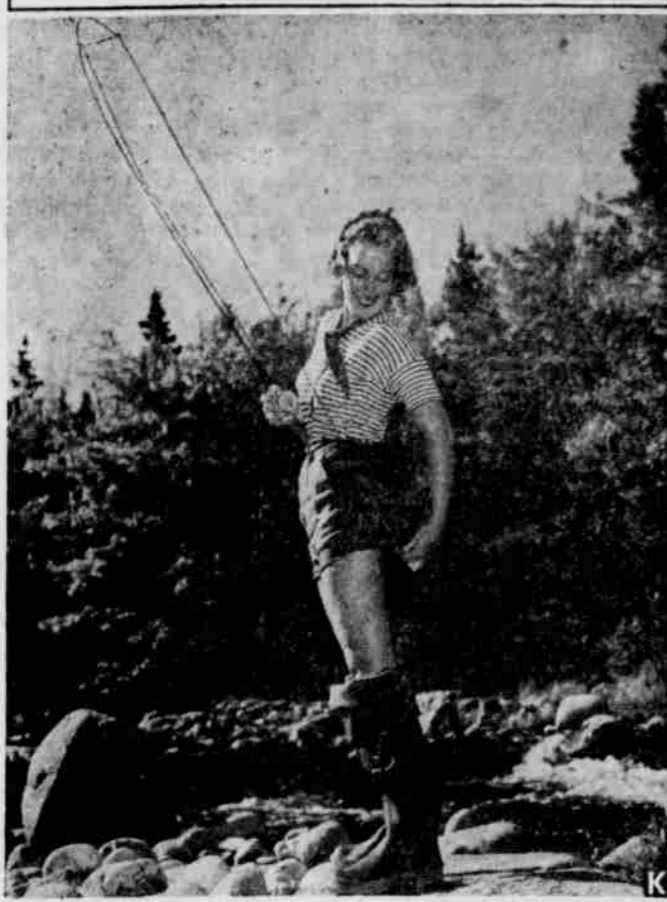
She's snagged her shorts with an erratic cast, but that isn't spoiling her Canadian fishing vacation. For most anglers, Canada and sport fishing go together like rod and reel. Where else can they find such an abundance of unspoiled lakes, rivers and streams, and so many fish? From April to October there's good fishing to be found all across Canada. For information on angling, write to Canadian Govt. Travel Bureau, Ottawa, Canada.