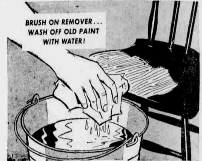
BRUSH ON REMOVER... WASH OFF OLD PAINT WITH WATER!

it's so easy with SHERWIN-WILLIAMS Wash-Away paint remover