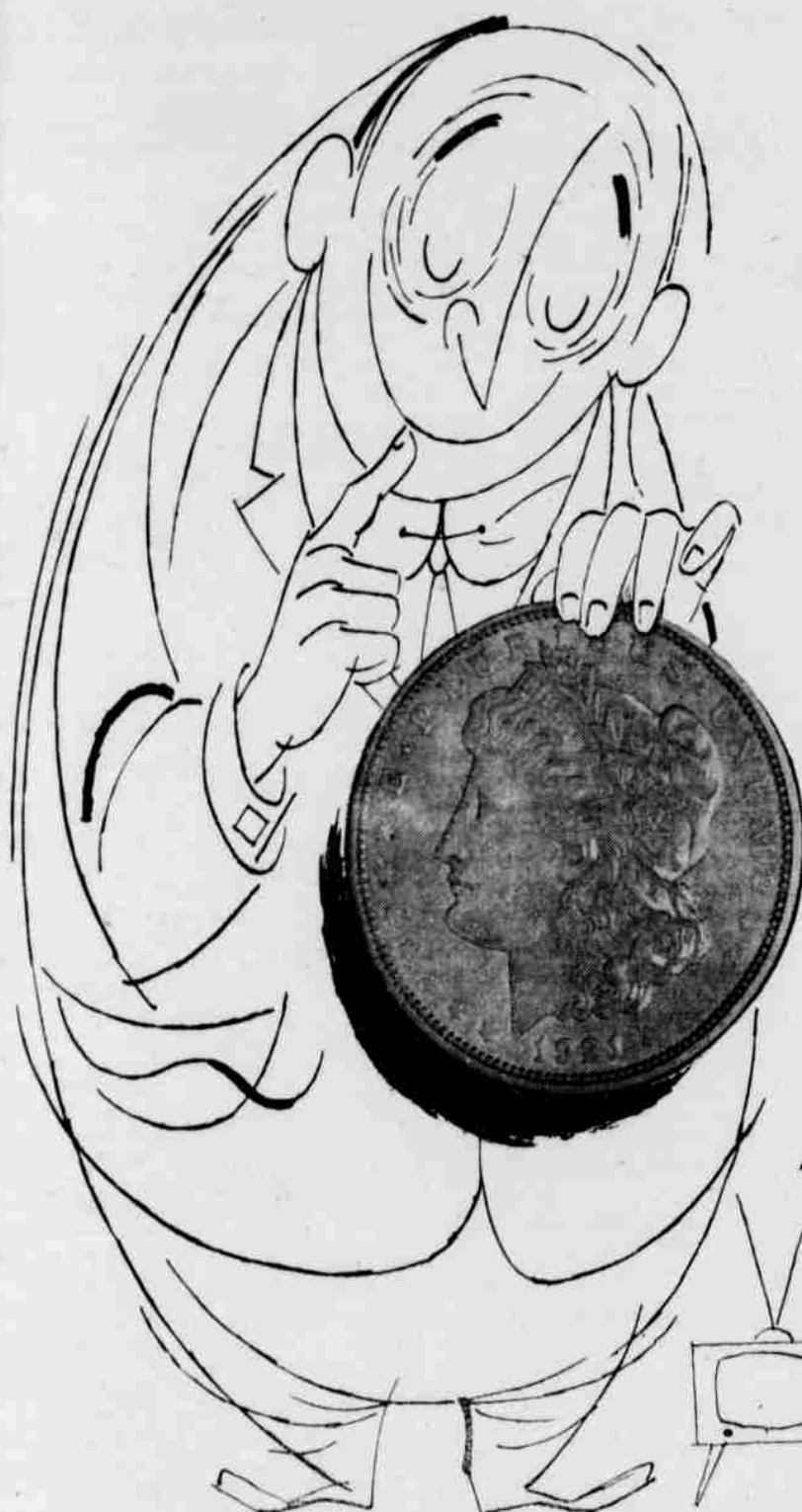
HEPPNER GAZETTE TIMES