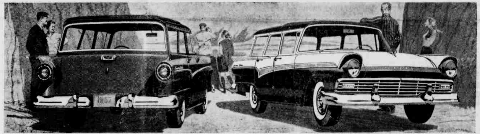
The 6-passenger Country Sedan