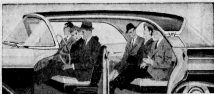
FAR BIGGER IN EVERY IMPORTANT DIMENSION —This year Mercury has grown bigger in every important dimension. For example, there is more headroom, leg room, shoulder room, hip room.