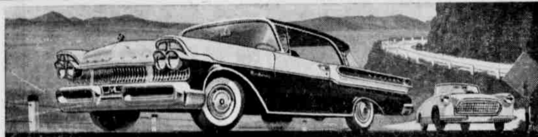
WIDEST RANGE AND CHOICE OF POWER IN MERCURY HISTORY —A 290-hp TURNPIKE CRUISER V-8 engine is optional on all models. In the Montclair series the standard engine is a 255-hp Safety-Surge V-8 with a Power-Booster Fan that saves horsepower other cars waste. A 255-hp Safety-Surge V-8 is standard in the Monterey series. A special M-335 engine (335-hp) is available at extra cost in Monterey models equipped with standard transmissions.