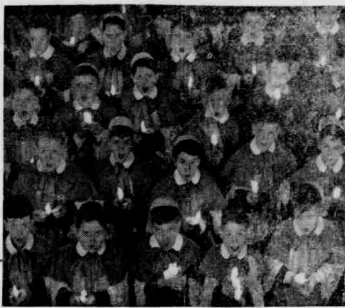
JOY TO THE WORLD... The famous boys' choir of St. Vincent Ferrer Church raises its collective voice in song during rehearsal of hymns which will be sung at Christmas Eve midnight mass. Boys are from eight to 14 years of age.