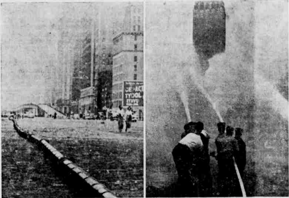
DEMONSTRATION OF PIPE in New York City which can be laid quickly over rough terrain to carry water for fire fighting, city water supply or to pump out flooded areas. This flexible coupled pipe is stored by the Federal Civil Defense Administration in warehouses throughout the nation for use in emergencies. New couplings allow pipe to be laid without leveling it.