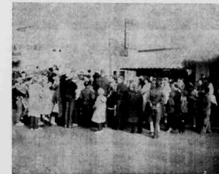
CENTER OF ATTRACTION, somewhere in this crowd of youngsters and parents, was Santa Claus who made his annual pre-Christmas visit to Heppner last Saturday. He greeted all his friends on the street then spent an hour in the Elks lounge getting the low-down from those who wanted to talk longer. He gave out about 500 sacks of candy during his brief visit.