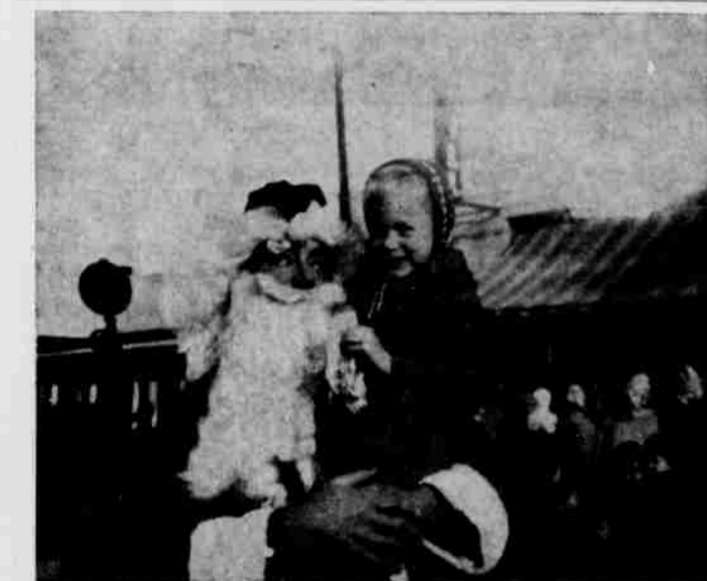
A MIGHTY HAPPY YOUNGSTER was this unidentified young lady when Santa took time out from his duties to pose with her for a picture. The jolly old fellow arrived by fire truck promptly at 1 p. m. last Saturday and was welcomed by over 500 children.