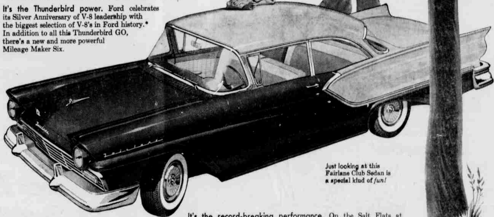
Just looking at this Fairlane Club Sedan is a special kind of fun!

It's the Thunderbird power. Ford celebrates its Silver Anniversary of V-8 leadership with the biggest selection of V-8's in Ford history.* In addition to all this Thunderbird GO, there's a new and more powerful Mileage Maker Six.