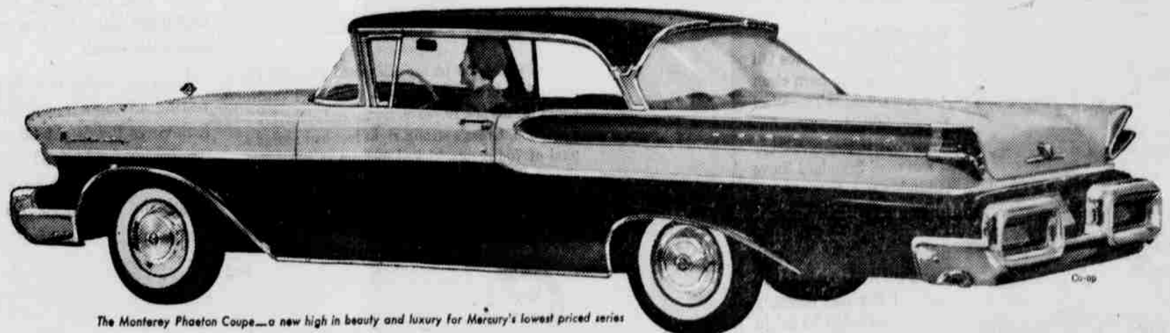
The Monterey Phaeton Coupe—a new high in beauty and luxury for Mercury's lowest priced series

Everything that counts in a car has been changed dramatically! Mercury for '57 presents: Dream-Car Design · Biggest size increase in the industry · Exclusive Floating Ride · New Keyboard Automatic Transmission Control · New 255 and 290 hp V-8 engines · Exclusive Power-Booster Fan · Dream-Car features everywhere you look. Stop in—see how The Big M outdates them all.