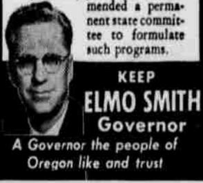
KEEP ELMO SMITH Governor A Governor the people of Oregon like and trust

THE AGING —While insisting that Old Age Assistance payments recognize higher living and medical costs, Governor Smith has given equal emphasis to programs that will utilize the skills and experience of our older people and furnish recreation they can enjoy. He has recommended a permanent state committee to formulate such programs.