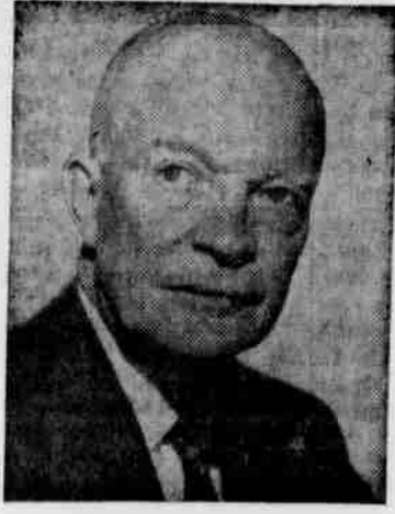
DWIGHT D. EISENHOWER PRESIDENT