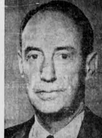
Opponent Adlai Stevenson