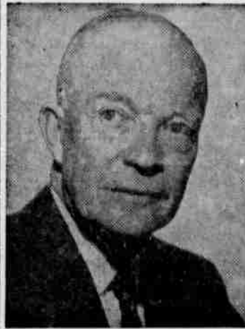
President Dwight Eisenhower