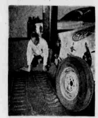
Make sure tires and chains are in good condition for win-

Radiator pressure guage tells story on the cooling system.