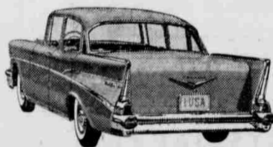
The new Bel Air 4-Door Sedan—one of 20 striking new Chevies.

Come see the new car that goes 'em all one better—the new 1957 Chevrolet!