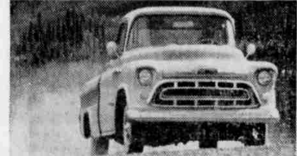
Alcan fleet reports up to 18.17 miles per gallon! That's the mileage reported by the Cameo Carrier, with Thrift-master 6 and Overdrive (optional at extra cost).

FIRST WITH THE MOST MODERN FEATURES! New 283-cubic-inch Taskmaster V8 is standard in Series 5000, 7000 and 8000, optional in Series 6000 at extra cost. Horsepower ranges up to 210 in Chevrolet's complete line-up of modern V8 and 6 truck engines. Revolutionary Powermatic Transmission—exclusive with Chevrolet trucks! This six-speed automatic, designed specifically for heavy-duty hauling, is an extra-cost option in Series 5000 and 6000 and all heavy-duty truck models. Hydra-Matic is offered in 3000 and 4000 Series models at extra cost. L.C.F. models outdate C.O.E. trucks in every way; yet offer all the traditional C.O.E. advantages. Heavyweight Champs with Triple-Torque tandem are rated at 32,000 lbs. GVW, 50,000 lbs. GCW. Special features include built-in 3-speed power divider.