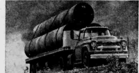
All the way in DRIVE range with Powermatic! This Powermatic-equipped 10000 Series tractor traveled the Alcan Highway in a single forward-speed range!