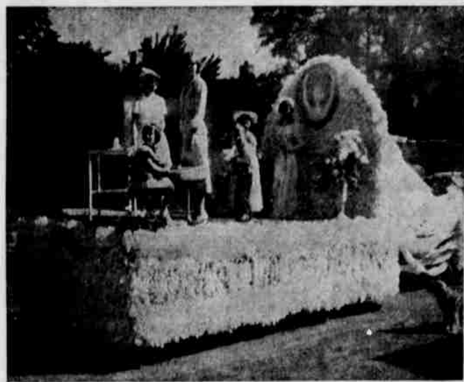
SWEEPSTAKES WINNER in Saturday's rodeo parade was this float entered by the Heppner Rodeo Optimist club. The parade boasted many more local floats than in previous years.