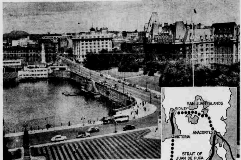
VICTORIA, B. C., with its old-English atmosphere, stately Parliament buildings, quaint shops and tea rooms, is one of the most picturesque cities in North America, filled with endless charm for the tourist.