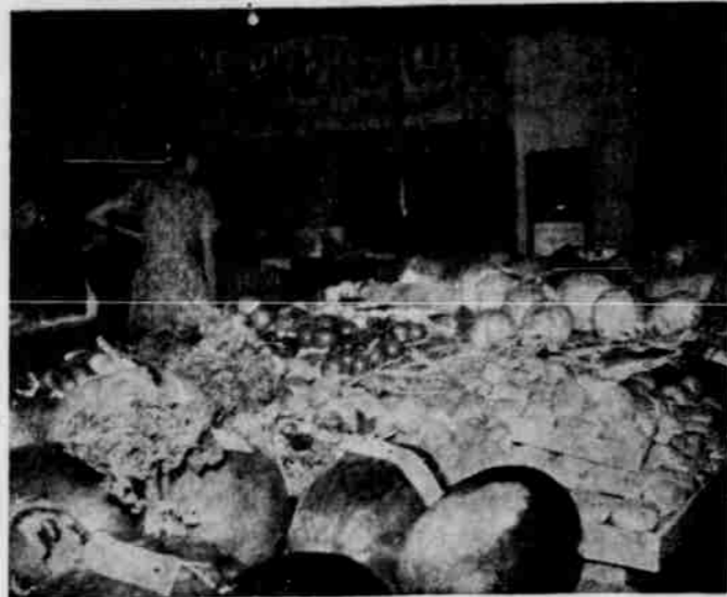
FRUITS AND VEGETABLE display at the fair brought many comments from visitors. The display in this division was larger than in any recent year. Only a portion of the many entries show in this photo.