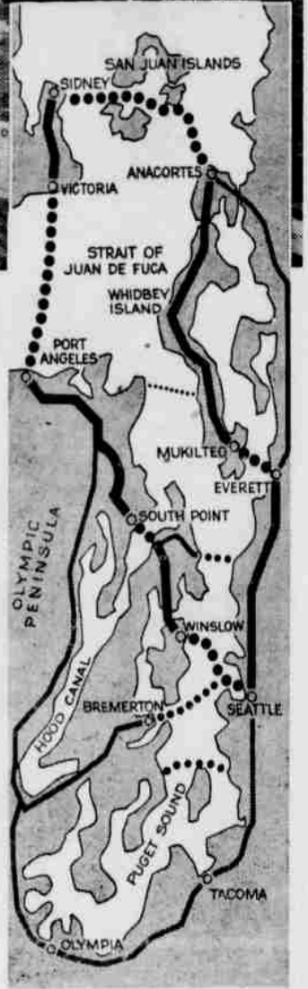
SCENIC CIRCUIT loop trip is shown in map at right. You can make overnight stops along the way depending upon your interests and the time you have. Several alternate routes are open to you in crossing lower Puget Sound, including a delightful journey down Hood Canal.